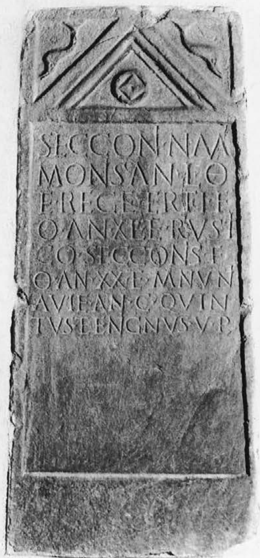
Kopriva, Ljubljana , 15 št. 10.