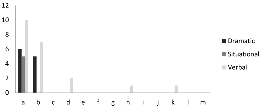
Chart 2: Correlation between irony type and translation strategy

Regarding the translation strategies used, the analysis shows that a) and b) are the strategies used the most. The figures show that a) (literal translation) is the dominant strategy with 58.3% of the TT ironic utterances following that strategy. b) (“equivalent effect” translation) is used for 36.1% of the TT ironic utterances, whereas of the other strategies, there are instances of only d) (2), h) (1) and k) (1).