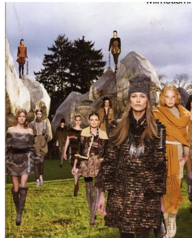
Figure 2: A Brownian, aimless promenade.

2d The creation of a child unexpected Landscaping vision (scholar experience on the water front of la Spezia Gulf, Portovenere, the U.F.O. land on the Park)