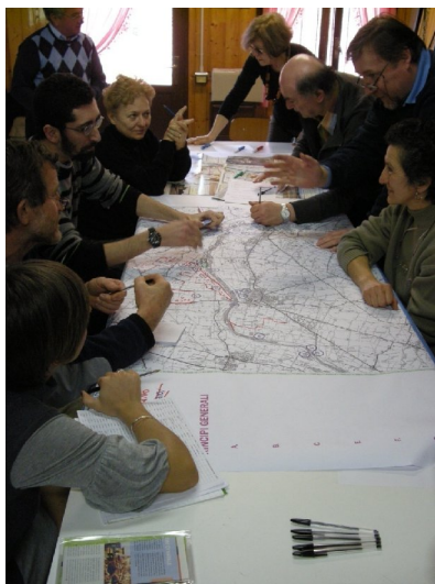
Figure 1: A social Group at work, preparing a landscape Contract.

Specific narrative and figurative art languages,