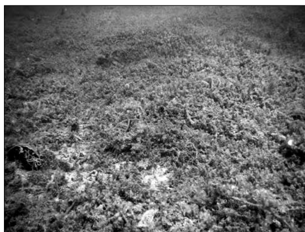
Fig. 1: The carpet of the alien algae Caulerpa cylindracea Sonder.

The results of the present study confirm the presence of C. cylindracea in 14 new locations along the western Istrian coast. It can be stated that this non-indigenous species has quickly spread all along the coast from Vrsar to Zambratija. Since its introduction in the 1990s, the alga has extended throughout the whole Mediterranean Sea, usually forming dense and large populations with