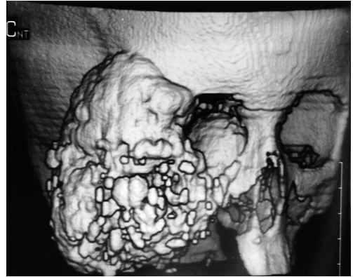
Figure 3. Three dimensional reconstructed image of the mass.

Osteosarcoma is the most common primary malignancy of bone, although only 6% to 10% of osteosarcomas occur in the craniofacial region. 1 Osteosarcoma of the craniofacial region is a relatively rare disease. 2,3 The mandible is usually reported as the most common site of involvement although there are some reports that mandibular and maxillary osteosarcomas have been seen in the equal frequency followed by the skull. 1,4,5 When compared with other locations, craniofacial osteosarcomas are less aggressive, occur in a more elderly population and prefer local invasion rather than distant metastases. The average age at the onset of osteosarcoma of the maxillofacial region is found in the third to fourth decade of life. 6 While a slight male predominance is reported by some au-