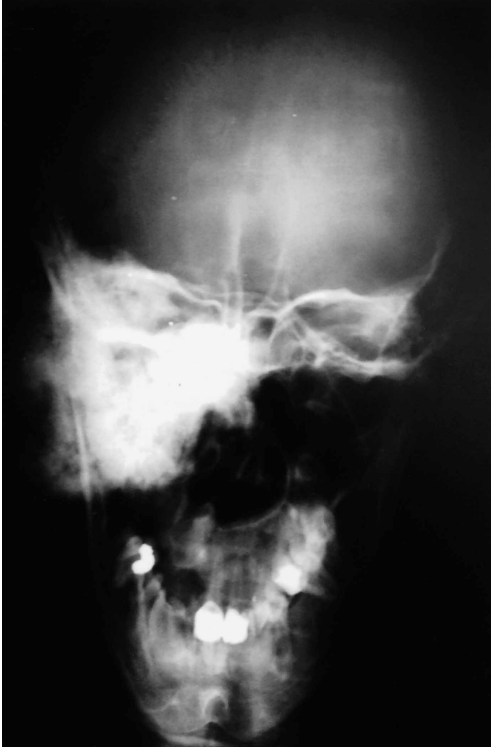
Figure 1. On Townes view plain film densely calcified and ossified mass can be appreciated.

of the neck. Her systemic examination did not reveal abnormal clinical findings. Chest X-ray, blood tests and abdominal ultrasonography were normal. A whole-body bone scan showed the increased activity in the right maxillary location. On the computerized tomography it was seen that the tumour exhibited the invasion into the upper palatinum and infero-lateral wall of the maxillary sinus, and caused a development of a centimetre defect in the base of the orbital cavity, however, there was no descent of the orbital structures. Although the tumour was in close relation to the medial wall of the maxillary sinus, this region appeared to be tumour-free. A punch biopsy of the lesion revealed the diagnosis of osteoblastic osteosarcoma of the maxilla.