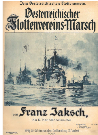
Figure 7 and 8: Polesaner Landwehr-Marsch and Österreichischer Flottenverein-Marsch, front pages.