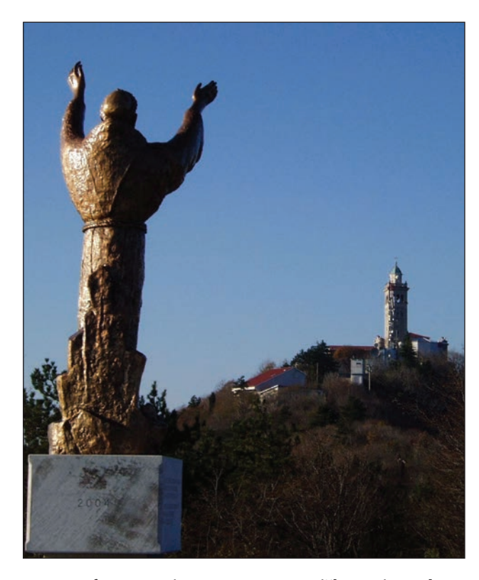
Statue of St. Francis, Sveta gora, Goriška region, Slovenia

1970s, a lot of shrines in the southern part of the Bohemian Switzerland were extensively devastated and the government let them fall into ruin; in 1989, however, a change occurred and the churches have gradually been reconstructed since (THETRIS Bohemian Switzerland Regional Analysis, 2013, 8-18).