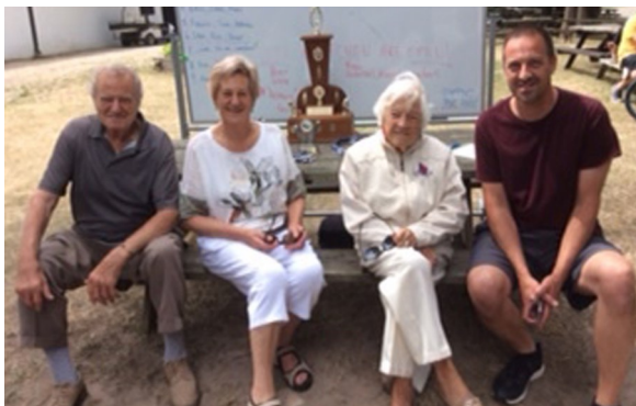
All this time I was finding myself