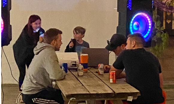
And I didn't know I was lost