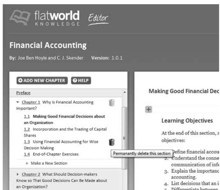
Figure 5: Possibility of changing the order of chapters.

own needs, principles, and behavior patterns. The functional and visual standards of designing e-resources must be observed. This is yet again not the resource author's job, but needs to be provided as an option (e.g. 508 Compliance in the USA).