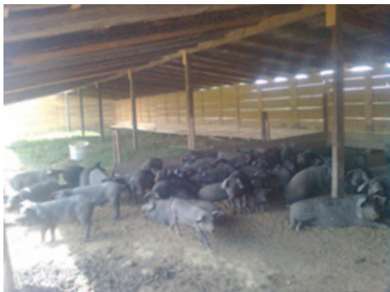
Figure 3: Facilities for sows and gilts.

The floor should be covered with litter. Animals are fed in troughs or on the ground, while the drinking water can be supplied by different waterers or water wells. Farrowing units consist of farrowing pens with size 6 m × 1.5 m. Piglets stay with a nursing sow for 7 weeks before weaned. At weaning, sows return into groups for mating. Weaners are kept in a separate unit in groups. Facilities should be fenced with wire mesh to 100 cm in height or with an electric shepherd. Fattening lasts up to the age of 1.5 years when pigs weigh between 130–150 kg.