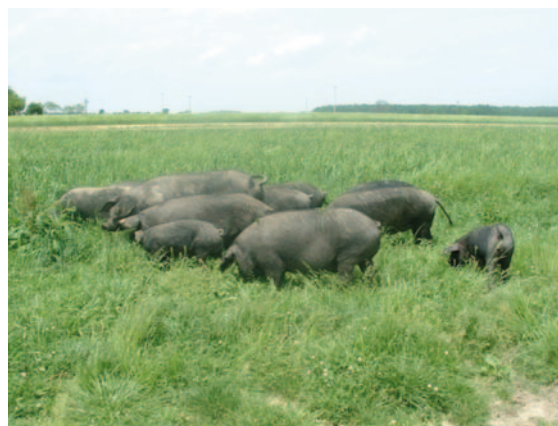
Figure 2: Pigs on the pasture.

In the case of Black Slavonian Pigs, extensive system of pig production refers to outdoor systems with shelters and pastures (Fig. 2). Area of 1 ha may hold up to 4 breeding sows (along with fattening pigs, piglets, gilts and boars). Production area must be split into partitions, and facilities that are located on that area must be constructed from natural materials and in a traditional style. Facilities for sows and gilts depends on the number of animals and for five sows or gilts, (Fig. 3) according to few authors Karolyi et al. (2010); Karolyi et al. (2004), Margeta (2013) should be semi-opened area of 30 m 2 .