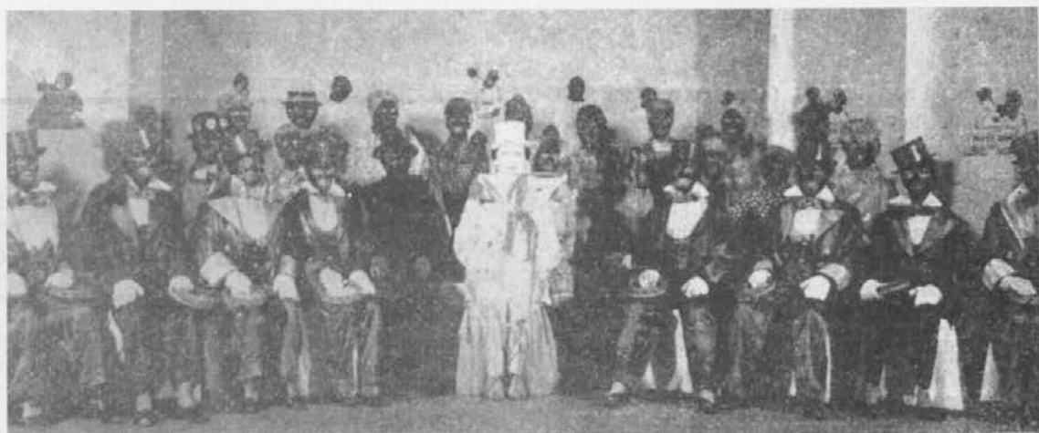
Top: Minstrel Show put on by the Choral Club of Br. 2 in 1947 was a "first" for the community – and Zveza! Below: A "Gay 90's Revue" was another presentation that the Choral Club members put on to the delight of singers and audience!