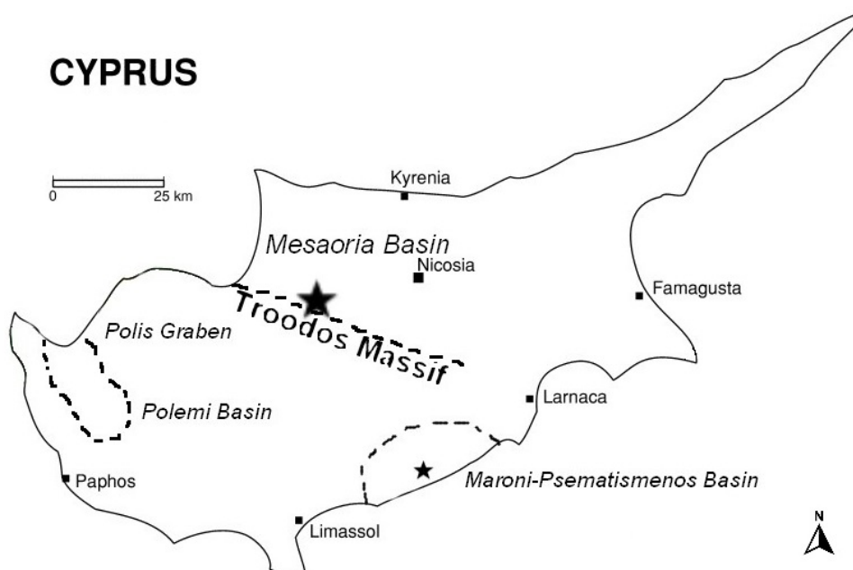
Fig. 2. Location of a number of basins with Miocene strata, with the type locality of Paguristes joecollinsi sp. nov. marked by a large asterisk; the provenance of the only other anomuran recorded to date from the Miocene of Cyprus, Palmunidopsis muelleri Fraaije, 2014b, is marked by a small asterisk. Image modified from Fraaije (2014b, fig. 1)

Included species: For fossil taxa, reference is made to Gagnaison (2012), Fraaije et al. (2015, table 1), Karasawa & Fudouji (2018, p. 23) and Beschin et al. (2018). For extant species, see Lemaitre & McLaughlin (2019).