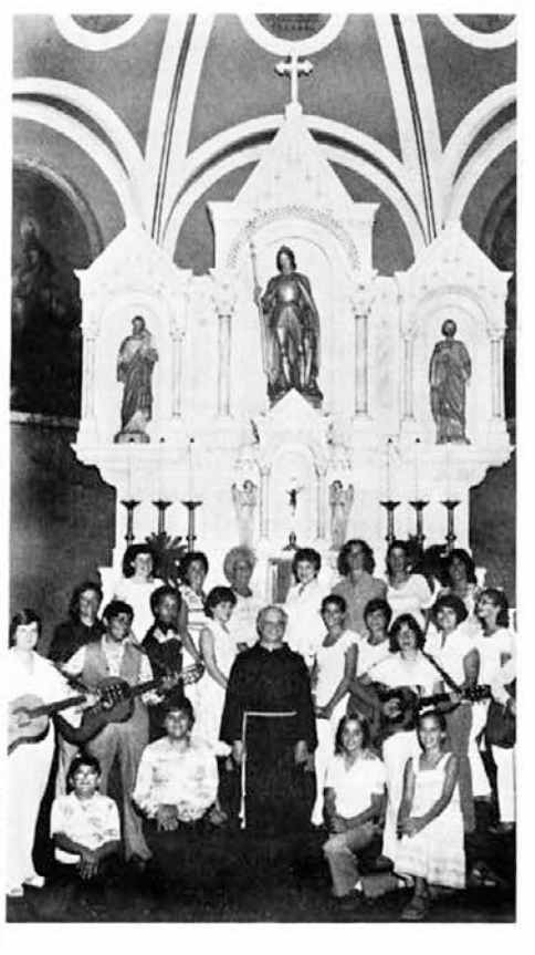
ST. GEORGE'S SINGING FOLK GROUP

Those of us who love Slovenian music and especially church music,