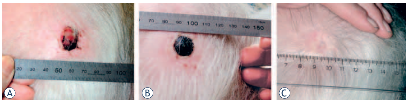
FIGURE 2: Lorem ipsum dolor sit amet, consectetur adipiscing elit. Morbi tempus viverra tincidunt. Nunc libero elit, gravida vel hendrerit sit amet, pellentesque sed augue.

of the tumor vasculature, and thereby decreasing pressure and enhancing delivery of chemotherapy to the tumor. 37 In a case series of 4 patients receiving bevacizumab and paclitaxel for breast cancer brain metastases, considerable activity was demonstrated with one complete response (CR) and 3 PR's. 37 Normally, the chemotherapeutic drug paclitaxel does not cross the BBB, so the addition of bevacizumab seems to have made a difference, and the preliminary results are encouraging.