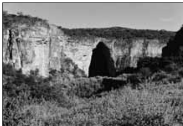
Fig 3: The entrance to the Lapa dos Brejões Cave.