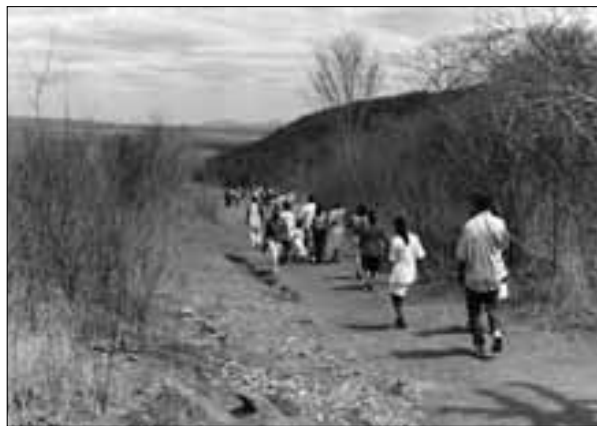
Fig 4: Pilgrims during their journey to the Patamuté Cave.

In other words, the cave became a place that could free them from the suffering caused by the constant droughts or at least minimize it. Steil (1998, 36) calls attention to this phenomenon. Chapels located in wild areas and harsh environment become privileged places for religious pilgrimage and welcome travelers, the sick or adventurers who cross fields and semi-deserts, a context that empowers the recognition of these spaces as sacred spaces (Fig. 4).