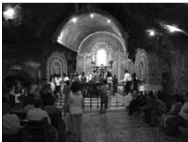
Fig. 2: The main altar of Bom Jesus da Lapa Sanctuary.

According to Sampaio (2002, 137-138), when a visitor enters the cave, the person experiences its extraordinary and exciting atmosphere. The spectator soon enters the darkness seeing the image of the crucified Bom Jesus da Lapa, offering consolation and cure for those who believe and those who have faith. The pilgrim also experiences emotions and look for the miraculous water that slowly drops from de walls and ceilings. Even non-Catholics cannot deny the effect of excitement when one arrives at the Sanctuary of Bom Jesus da Lapa.