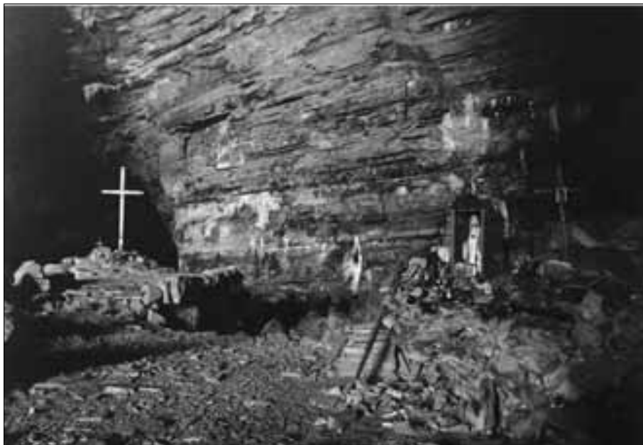
Fig 5: Religious objects inside the Lapa dos Brejões Cave.

The mythical sense of the cave is present at all times and this feature starts with its location. The cave is on the top of a 50 meter-high hill, and the access to it is an irregular and steep path that adds to the pilgrims' suffering. This sacrifice is understood as a way to pay for the sins committed on a daily basis and become purified.