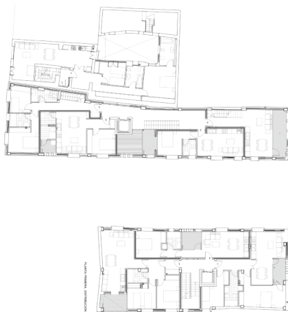
Slika 2: Zgradbe A, B in C. Prvo nadstropje. Figure 2: Buildings A, B and C. First floor.