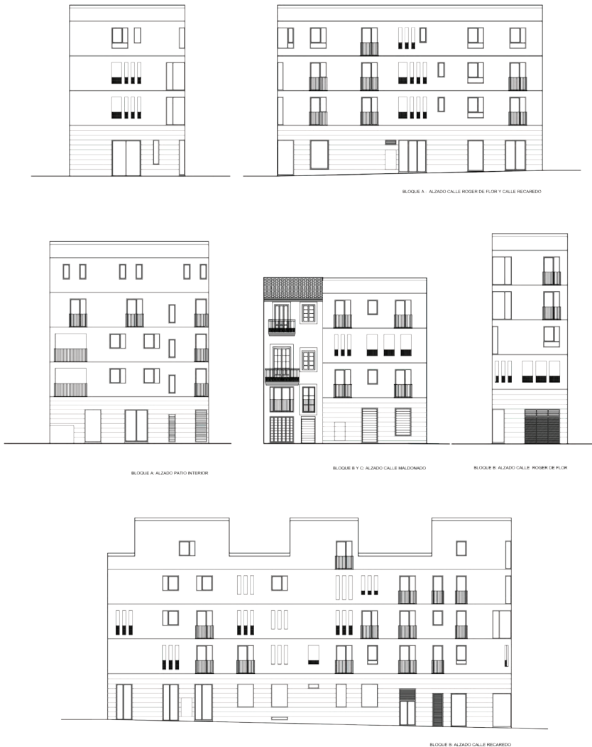
Figure 5: Elevations of all the compositions studied to provide varied and heterogeneous vertical readings of the narrow plots in the historic centre.

Slika 5: Pogled na fasadni ovoj, razvidna je raznolikost osno pozicioniranih odprtin.