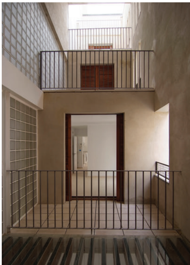
Figure 7: View of the interior sloping courtyard in building B, staggered into terraces.