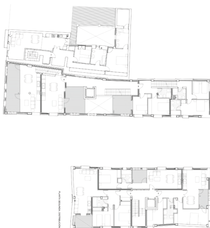
Slika 3: Zgradbe A, B in C. Drugo nadstropje. Figure 3: Buildings A, B and C. Second floor.