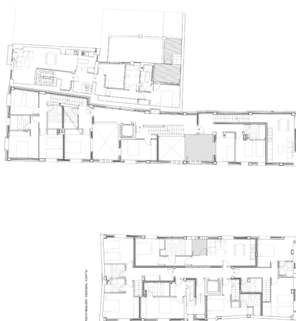
Slika 4: Zgradbe A, B in C. Tretje nadstropje. Figure 4: Buildings A, B and C. Third floor.

The cross-section of building A and especially that of building B resemble a large Gruyère cheese with courtyards, terraces and garden spaces dug out from the building's volume. With the correct orientation these spaces provide exceptional sunlight inside the building and allow strategic cross-ventilation which counters the excessive heat caused by the sun inciding on rooms in the south and west facing façades. Nevertheless, in both buildings A and B, the continuous skin of the façade deliberately built 40 cm thick to accommodate the sliding shutters inside, towers over these terraces, perforating spaces following composition guidelines suited to the historic narrowness of the plots in the neighbourhood to avoid an excessively uniform and homogeneous horizontal interpretation which would alter the scale of the building in the urban landscape. Following local building tradition, the louvered shutters have moveable slats in all their sections and allow a nuanced and suggestive regulation of the strong Mediterranean daylight in the city ([Vegas et al. 2014]). Like an onion skin the façade can be divided into independent strata with tilt and openable windows, sliding louvered shutters whose textural variations depend on slat angle, and the lime mortar render of the outer façade which provide the building envelope with interesting architectural variations.