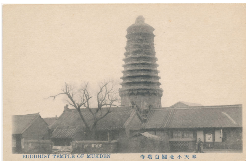
Figure 8. A Buddhist temple with a pagoda in Mukden (Shenyang). On the back side, Karlin notes it is quite different from the Japanese temples.

The manuscript has no special introduction, although the first sentence of the chapter on Japan may serve as a sort of preface to the entire volume: “In the Far East, Buddhism rules and colours all views, either directly or indirectly” (A, 1). While echoes of this statement are found in various parts of the text, Karlin discusses a breadth of beliefs and practices, only some of them Buddhist. She sometimes intentionally groups them, implying a sort of classification, while at other times listing them haphazardly—this is especially the case in the shorter Korean chapter. Contrary to the geographical key she uses as the main organizing principle, I will summarize the content according to the implicit categorization, thereby elucidating Karlin’s conceptual scheme of various religious practices.