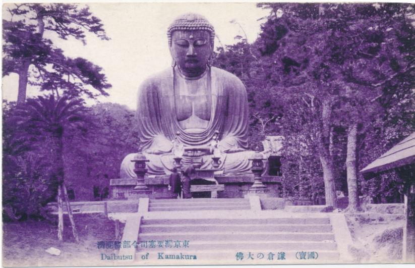
Figure 9. A postcard with the famous Great Buddha of Kamakura (Kamakura Daibutsu 鎌倉大仏), which Karlin (1930a, 187; 2006, 232) calls “the best expression of Buddhism I have seen anywhere”.

According to Karlin, while Buddhist teaching was “wonderfully pure” when it came to Japan in the 6th century CE, people soon realized that it had many manifestations and artists began to represent these in the form of deities, such as Kannon 觀音, the goddess of mercy. She then explains some of the most prominent bodhisattvas and deities of Japanese Buddhism: Jizō 地藏, Daruma 達磨—representing Bodhidharma, the founder of, the fierce protector deity Fudō 不動, the seven lucky gods, of whom goddess Benten (or Benzaiten 弁才天), receives most of Karlin’s attention. In this section, Karlin also describes a Buddhist funeral.