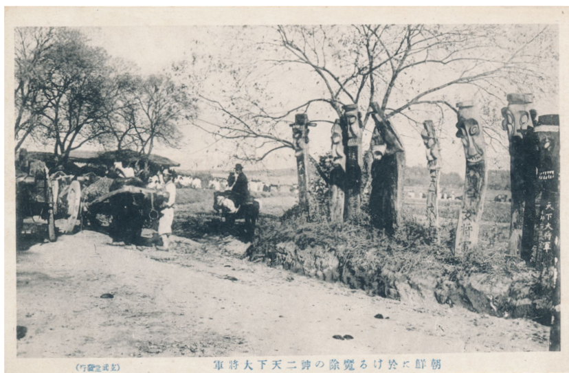
Figure 12. A postcard portraying Korean village guardians—Jangseung.