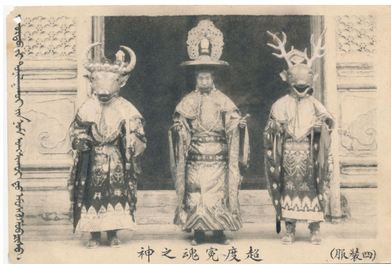
Figure 10. A postcard depicting the costumes and masks used in Tibetan Buddhism for performance of the ceremony for pacifying the souls of those who suffered a bad death.

Buddhist teachings in general, she finds that Buddhism in China, while retaining the fundamentals, has for the most part strayed into the superstitious and fantastical. She blames this on “the Lamaism of Tibetan Monks” (A, 48), yet does not explicate this position any further. 29 She therefore discusses neither the Chinese nor Tibetan Buddhist practice in any detail, but simply mentions a few Buddhist deities—Bodhisattva Guanyin 觀音, the “laughing Buddha” (笑佛; Budai) and the demon king Mo Wang 魔王, likening the latter to Shiva, the Hindu god of destruction. In addition to a sentence or two of introduction for each of the said deities, she also gives the corresponding Japanese names.