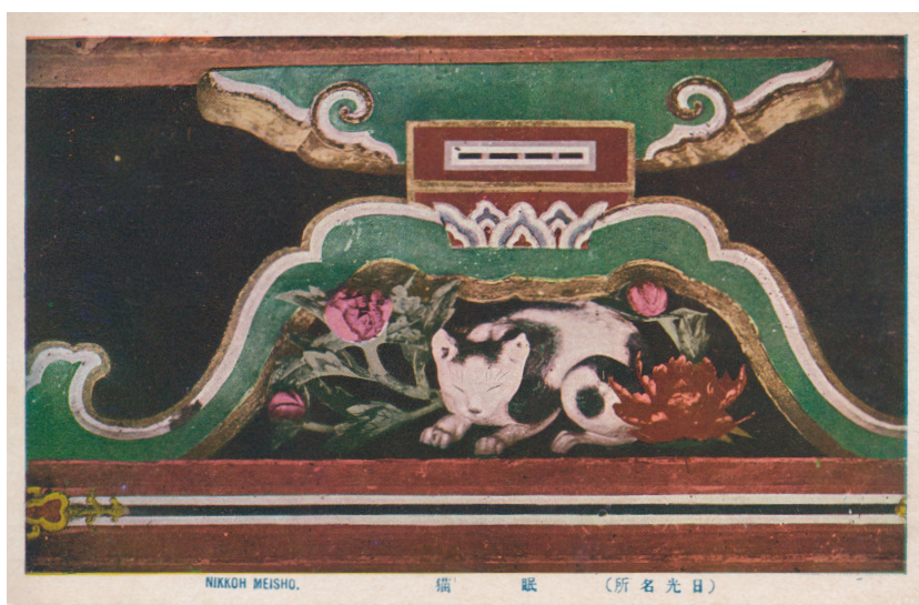
Figure 13. A postcard depicting the famous wood carving of the sleeping cat (Nemuri-neko 眠り猫) at the Tōshō-gū Shrine in Nikkō 日光東照宮.