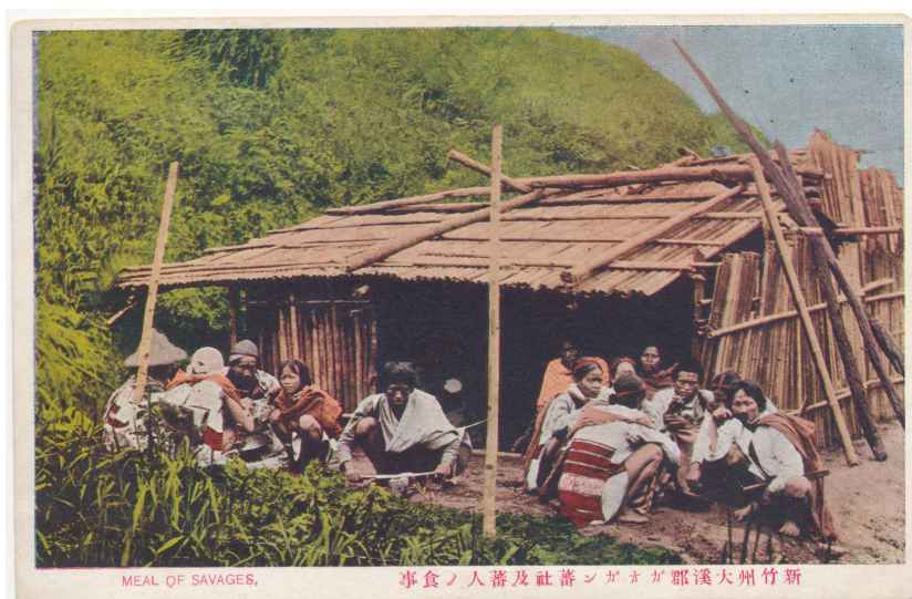
Figure 6. A Japanese colonial-era anthropological postcard portraying a group of Atayal during a meal.