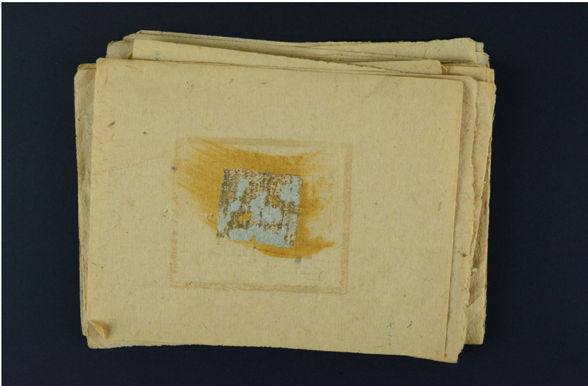
Figure 14. Chinese sacrificial paper money, also known as spirit money, burned in ancestor worship or as an offering to various deities.

yet there is also an inkling of a system in the way she organized her first-hand observations and second-hand information. The brief introductions are followed by origin myths, then come “religions”, “superstitions”—first the more complex beliefs and then more mundane magical acts. Interspersed throughout the text are references to symbolism and the year ritual cycle, while rituals of the life cycle come last. The final paragraphs of each chapter seem reserved for the left-over information—brief references or simple enumerations of unrelated customs or, in the case of China, descriptions of some of the temples she visited in Beijing, the longer versions of which can be found in her travelogue (1930a, 235–38; Karlin 2006, 294–99). In the final section of my analysis, I attempt to unpack Karlin’s conceptual scheme and method, by situating them in the broader intellectual trends of her time.