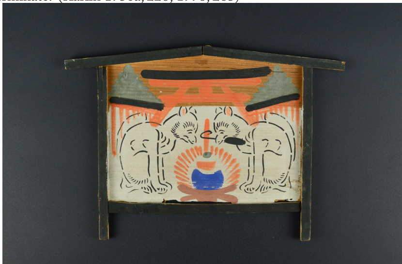
Figure 2. A wooden board painted with a motif of the Japanese Inari cult.

Such an insignificant step—hesitation between two guesthouses, an incidental inquiry—so often determine the future, the human life. When I later remembered these tiny episodes, I often felt gloomy. It cannot be a pure coincidence that determines one's life. Yet, on the other hand: is our every action already a seed in the bosom of future, which only needs to germinate? (Karlin 1930a, 226; 1996, 283)