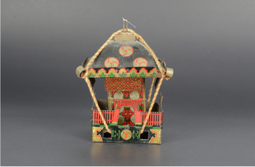
Figure 1. A miniature of mikoshi 神輿, a Shinto portable shrine.