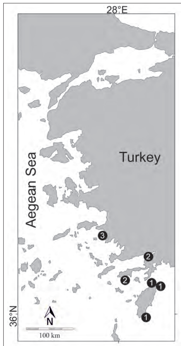
Fig. 1: Capture sites of Portunus segnis specimens in the Aegean Sea between 1991 and 2018: (1) Plimmiris (SE Rhodes), August 1991, 1♂ / Karakonero (NE Rhodes), March 2000, 1♀ / Gulf of Trianda (NW Rhodes), March 2000, 2♀ (Corsini-Foka et al. 2004); (2) Palamutbükü, 12 August 2004, 1♀ / Karacasöğüt, Gökova Bay, 26 June 2006, 1♀ 1♂ (Yokeş et al. , 2007); (3) Akköy Lagoon, 19 June 2018, 1♀ 1♂ (this study).

On 19 June 2018, two specimens of Portunus segnis (Fig. 2) measuring 75 mm (male) and 81 mm (female) in carapace length (CL) were purchased at a fish market in Urla, Izmir. According to the fishmonger these swimming blue crabs had been caught incidentally with a gill net in the Akköy Lagoon, Didim (approx. coordinates: 37°28'N - 12°23'E), in the southeastern Aegean Sea, on a sandy/muddy bottom at a depth of 2-3 m (Fig. 1). Once the existence of these blue crabs in the Akköy Lagoon had been confirmed (C. Ovalıoğlu,