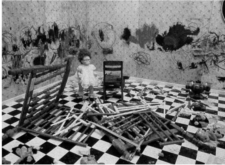
(left): Kim Dingle, Priss , 1994. Mixed media.