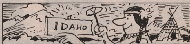
The name Idaho comes from an Indian word meaning "gem of the mountains."

Wear light clothing so you can see the ticks and brush them off. Try to shower every day if you're in an endemic area, because then if the tick gets on your skin, it often doesn't attach itself right away. And if it is attached, it doesn't always transmit the bacteria immediately. You may be able to wash it off before there is any chance of infection.