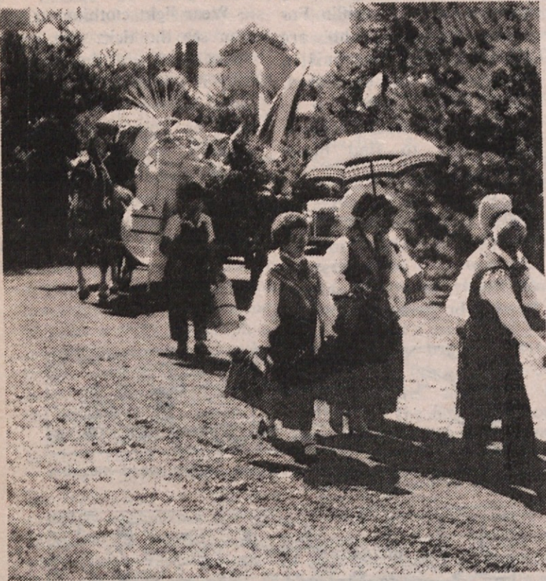
Slovenska Pristava, Slovenian recreation area in Harpersfield Ohio celebrated its 25th anniversary on Sunday, August 24. There were religious services, parades, speeches, music, food and the largest crowd ever - to make the day perfect. More photos of the day's activities are on pages 6 and 7.