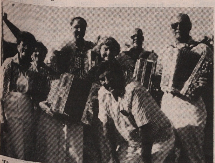
The Euclid Squeezeboxers were also entertaining at the Collinwood Home Homecoming on Sunday, Aug. 24.