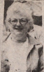
by Eleanor Cerne Pavay (Continued)

The beach is made up of gravel and not sand. We are passing a pink building which is called Englishman's Castle. It is a lovely pink castle with turrets that are curved on top. The castle has now been divided into apartments. It was here that the French film "Beauty and the Beast" was filmed. We are getting a wonderful view of the big bay. No wonder this area is a painter's paradise. It looks more like an Italian town and it should