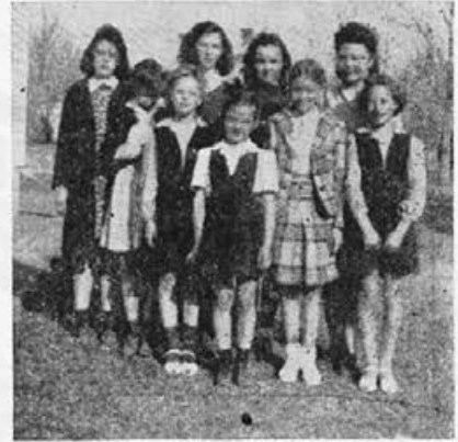
Girls of Circle 28, all very active.

the girls always manage to make up for it with their activities.