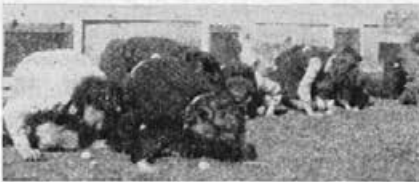
Circle No. 28: Children rolling eggs with their nose at Easter party.

shows children rolling eggs with their nose at a spring party.