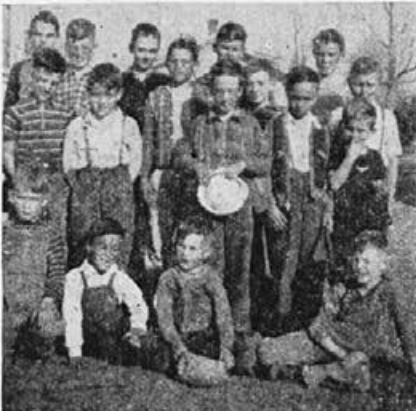
These are the boys of Circle 28.

Group No. 2 shows the boys of our Circle. In this group there are 16 boys—count them—sixteen nice boys who enjoy the meetings and especially the various games and parties.