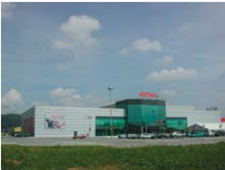
2.3 New shopping centre in Ljubljana