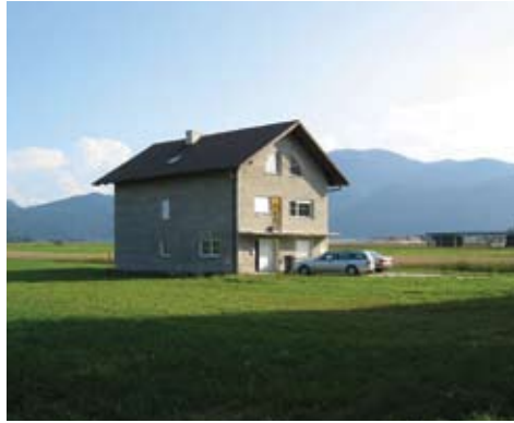
2.2. New single family house in Ljubljana