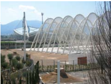
2.5 New Olympics 2004 stadium in Athens