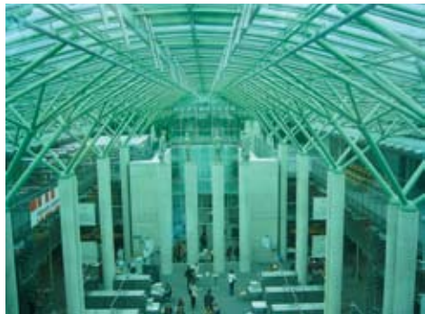
2.4 New university library in Warsaw