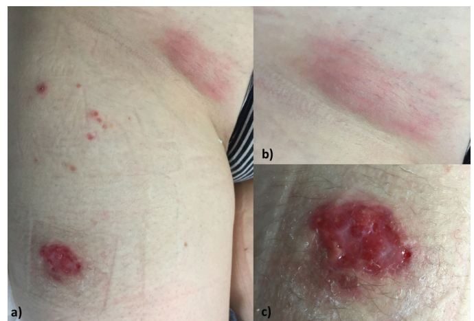
Figure 1 | Ulcer of the right thigh (a, c) and inguinal adenopathy (a, b).

levofloxacin 750 mg/day, and amikacin 1,000 mg/day for 3 months followed by clarithromycin and levofloxacin for another 3 months with complete resolution of the lesions (Fig. 2). The patient is free of disease 6 months after stopping treatment. Local public health authorities were contacted and, after collecting multiple samples including water samples, they were able to eradicate the focus of contamination.