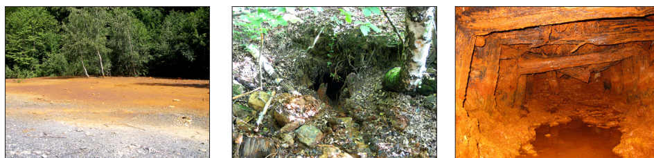
Slika 4: Rudnik Bakovići (žveplova voda in vhod)