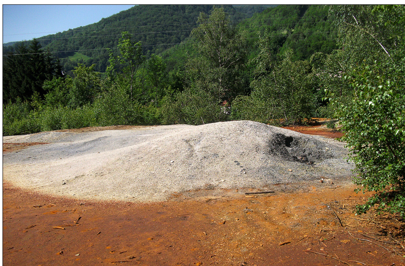
Slika 6: Jalovina iz rudnika Bakovići