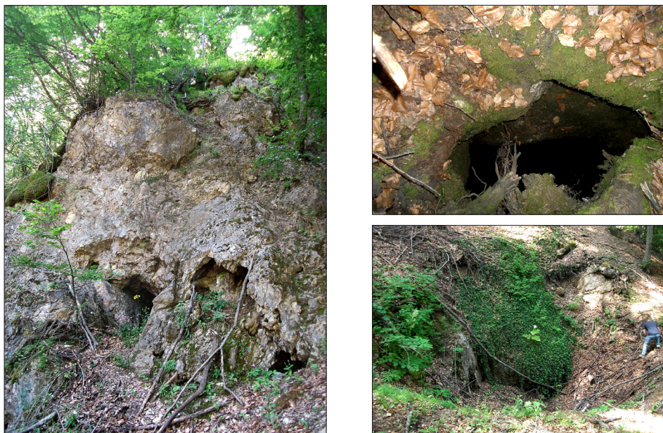
Slika 3: Kopi v rudniku Dusina

Dusina mine is referred in the literature as the iron mine (descriptions of an old furnace, large hammers driven by water) while somewhat further from Dusina lead and silver were excavated in the so called Saxony pits. Jurković (1996) states how numerous ore occurrences were explored in the area of Dusina. Saxons used to dig caves in very solid rocks that were crisscrossed with mineral veins. One such cave was singled out for this study. The pit is located west of the Dusina village (Figure 1) and can be reached by the gravel road Dusina–Pogorelica or by challenging hiking trail. Traces of former mining activities are preserved on the site – entrance (window) to the former mine (Figure 3). The site has certain geotouristic potential such as rock outcrops, more pits nearby, and two caves (one is about 300 m east of Saxon pit and the other is about 400 m southwest of the village Dusina).