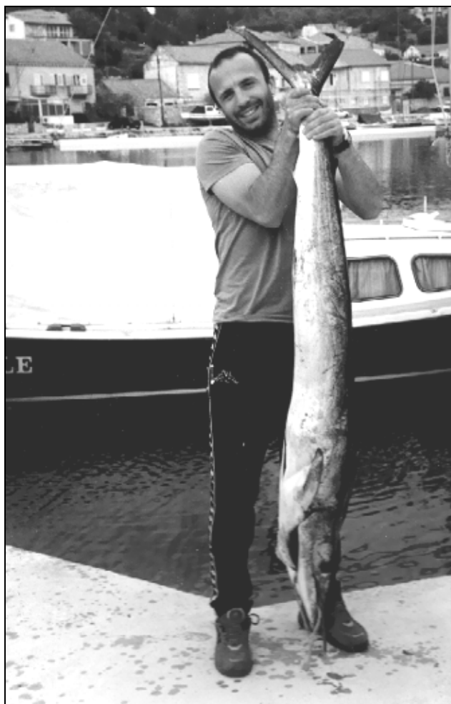
Fig. 4: Tetrapturus belone caught near island of Sušac (TL = 180 cm, W = 1850 g).

Sl. 4: Primerek vrste Tetrapturus belone , ujet v bližini otoka Sušac (TL = 180 cm, W = 1850 g).