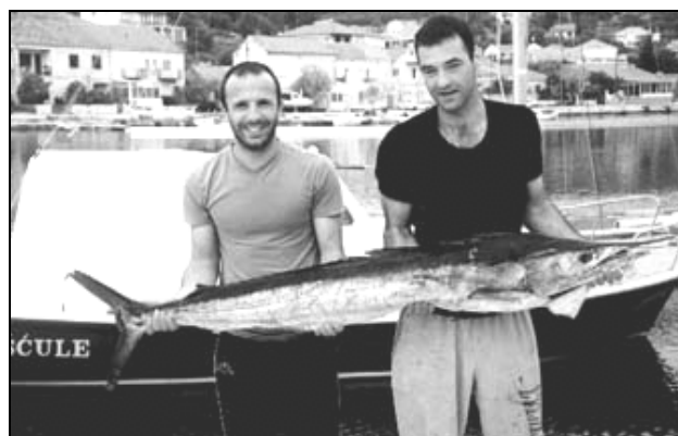
Fig. 3: Tetrapturus belone caught in Vela Luka harbour, island of Korčula (TL = 186 cm, W = 2300 g). Sl. 3: Primerek vrste Tetrapturus belone , ujet v pristanišču Vela Luka na Korčuli (TL = 186 cm, W = 2300 g).

The first record of this species in the Adriatic was made by Nardo (1827), the second in 1846 (Trois, 1880). Gridelli (1931) noted that this species was rare