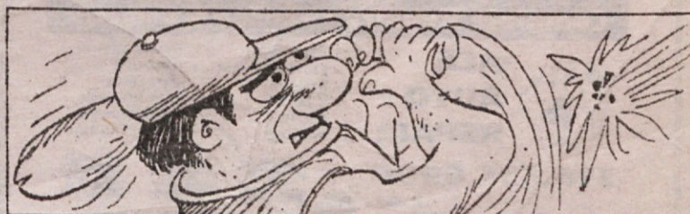
On May 26, 1959, Joe Adcock of the Milwaukee Braves hit a home run with two men on base in the bottom of the 13th inning of a scoreless game. But because Adcock passed another runner on basepaths, he was only credited with a double, making the final score 1-0.

Members and friends are cordially invited to come and enjoy the beautiful landscape and an afternoon of leisurely fun and enjoy the company of friends at Pristava.