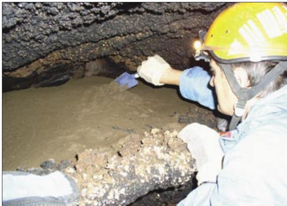
Fig. 2: Sampling of sediments in speleological objects.