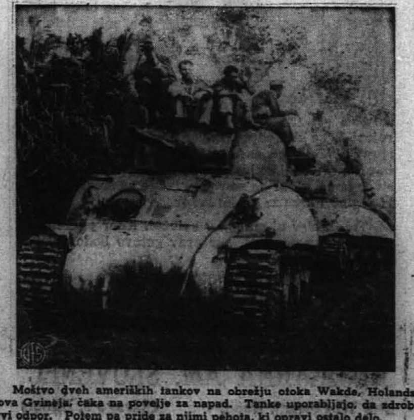
Moštvo čvoh ameriških tankov na obrežju otoka Walde, Holandska. Nova Gvinejska čaka na povelje za napad. Tanke uporabljajo za sdrbitje prvi odpor...