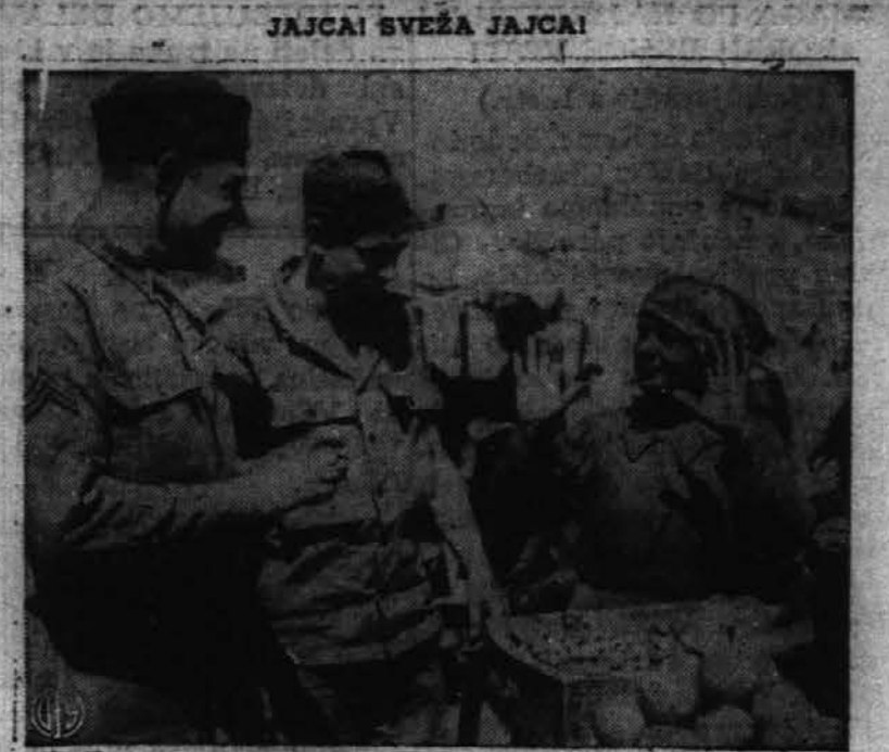
Dva Amerikanci, oba doma v državi Michigan, si ogledujeta, kako se vrši kupčija s jajci v mestu Foggia, v Italiji. Italijanska žena ne zna angleško, pa to je ne moti pri kupčiji...