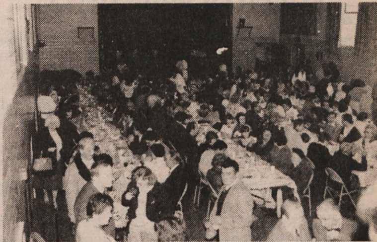
Šolska dvorana farne šole pri Mariji Vnebovzeti v Clevelandu je bila 26. januarja dobro zasedena in sicer na letnem kosilu Slovenske šole pri Mariji Vnebovzeti.