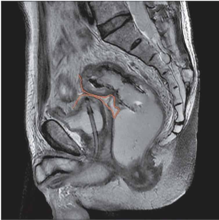
FIGURE 1. Sagittal view of the peritoneal reflection (red line) by rectal MRI.

rectum into two parts, that is, the intraperitoneal and extraperitoneal regions, which are referred to considerations of the venous and lymphatic drainage systems of the rectum. 2 In particular, extraperitoneal rectal tumours disseminate mainly through the systemic pelvic venous and lateral lymphatic drainage systems, whereas intraperitoneal rectal tumours disseminate mainly through the superior haemorrhoidal and inferior mesenteric venous and lymphatic drainage systems. 2 Furthermore, Benzoni et al. concluded that tumour location in relation to the peritoneal reflection is a prognostic factor in rectal cancer. 2 In this study, it was found that extraperitoneal rectal tumours are more aggressive than intraperitoneal tumours, even when treated by neoadjuvant chemoradiotherapy before surgery, which is common approach in the treatment of rectal cancer. 2-4 Thus, it appears that the peritoneal reflection might be useful for the adaptation of different treatment strategies in rectal cancer. Even though the definitions of intraperitoneal and extraperitoneal locations are ambiguous in relation to the mesorectum, it may be that the use of the peritoneal reflection as a discriminating structure in the pelvic cavity enables the differentiation of the locations of rectal tumours to the intraperitoneal and extraperitoneal regions.