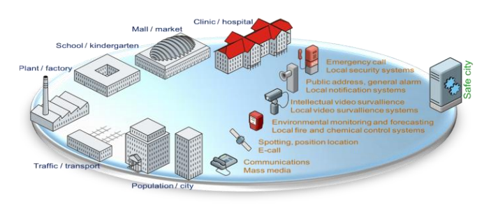
Figure 2: The "Safe City" solution and its features

Most safe-city projects start with a video-surveillance system used to monitor the traffic / transport, public places, areas of criminal activity, social facilities and facilities of the residential sector. The intelligence inside the video analytics brings added-value to the complete solution, including face recognition, shape detection and vehicle-plate numbers. The video analytics enables connectivity of additional systems into the platform (e.g., malls, hospitals, schools, factories, railway stations).