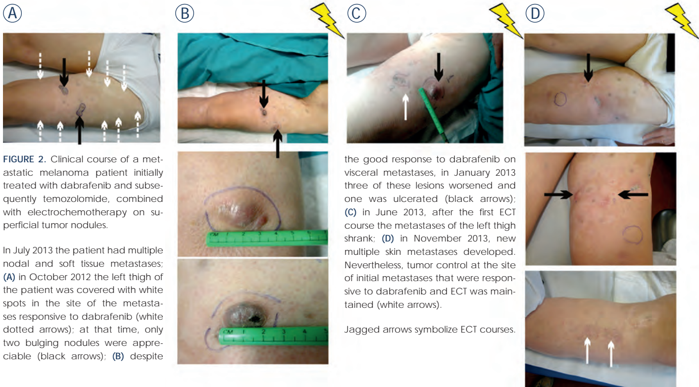
FIGURE 2. Clinical course of a metastatic melanoma patient initially treated with dabrafenib and subsequently temozolomide, combined with electrochemotherapy on superficial tumor nodules.

In July 2013 the patient had multiple nodal and soft tissue metastases; (A) in October 2012 the left thigh of the patient was covered with white spots in the site of the metastases responsive to dabrafenib (white dotted arrows); at that time, only two bulging nodules were appreciable (black arrows); (B) despite