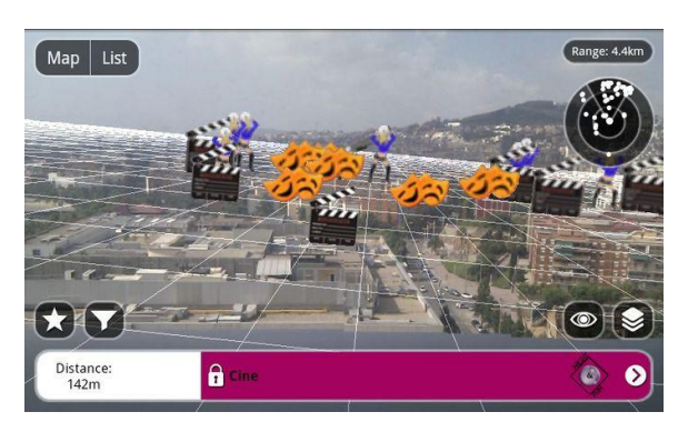
Figure 2: Layar AR browser [6] uses the camera and location and orientation information of the device to display the nearby cinemas and theatres

location is then based on the use of an interactive map showing the current location of the user and the desired destination as well as the optimum way between the two. One of the ever-growing possibilities is also the use of augmented reality, in which the virtual marks of the desired objects are added to the actual picture of the surroundings captured by the camera of the phone or other mobile device. Fig. 2 shows an example of a city guide based on augmented reality and the web service Layar [6].