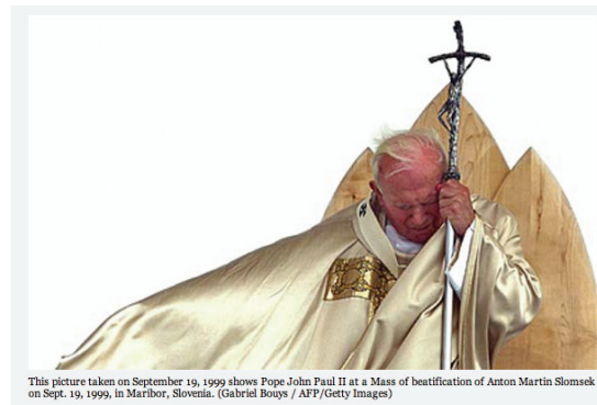
This picture taken on September 19, 1999 shows Pope John Paul II at a Mass of beatification of Anton Martin Slomšek on Sept. 19, 1999, in Maribor, Slovenia.

Potem, ko je bil uradno potrjen čudež potreben za beatifikacijo papeža Janeza Pavla II., se nadaljuje postopek in bo razglasitev za blaženega potekala na belo nedeljo (1. maja), tudi imenovano nedeljo božjega usmiljenja. Običajno se postopek za svetništvo začne šele po določenem času, tukaj pa so napravili izjemo in so ga začeli kmalu po njegovi smrti.