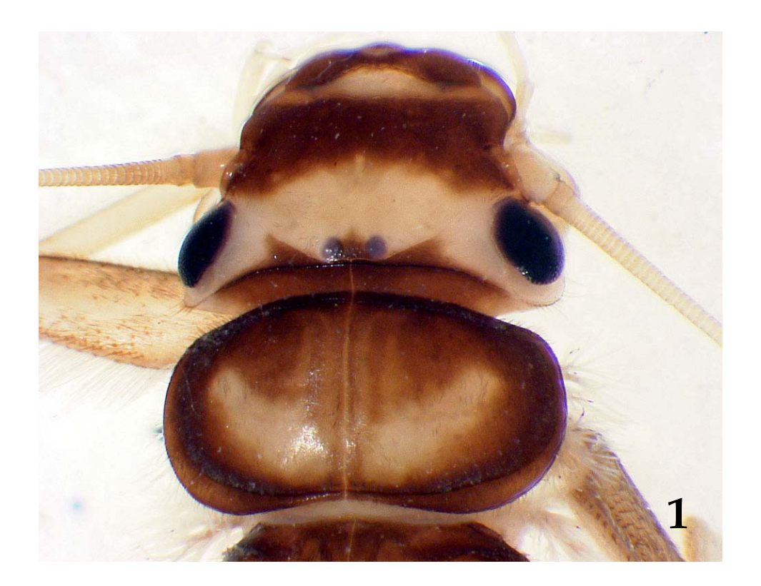
Fig. 1. Neoperla sp. larva. Head and pronotum, dorsal view.