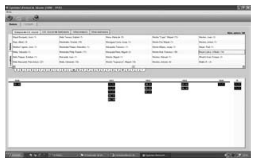
Figure 3. Classification according to authors' name. The example corresponds to the chronology of letters sent by the German linguist Wilhelm Meyer-Lübke.

The program included on the CD-ROM comprises a search screen. The letters are classified alphabetically by author (Figure 3) or by point of origin (Figure 4). The name of each author or place is followed by a figure in brackets which shows the number of letters related to these items.