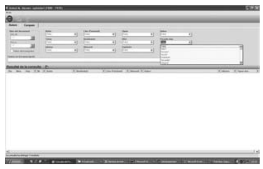
Figure 6. Searching according to different criteria – in this case, according to key words.