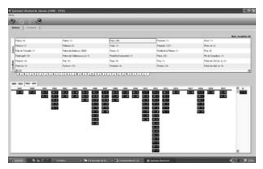
Figure 4. Classification according to point of origin. The figure shows the place names beginning with the letter P appears. In blue, the chronology of letters sent from Paris is shown.