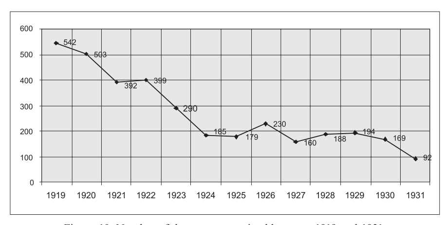
Figure 10. Number of documents received between 1919 and 1931.