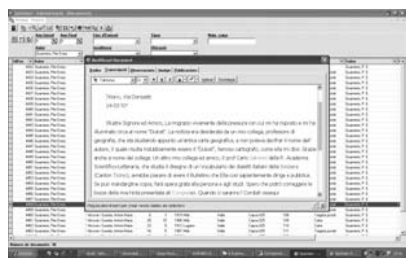
Figure 2. Screen showing a transcribed document. This figure corresponds to a letter from the Italian philologist Pier Enea Guarnerio.

Figure 2 shows the transcription of a letter. This document includes three types of marks in order to obtain a complete indexation: anthroponyms (8.451;<sup>5</sup> in fuchsia), toponyms (2.071; in blue), and key words (920; in green).