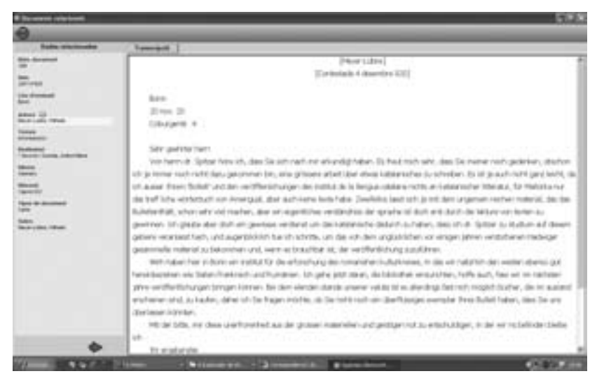
Figure 5. The transcription of a letter from Meyer-Lübke.

In figure 3, each label in blue corresponds to a letter of the correspondence (14 documents) that Wilhelm Meyer-Lübke sent to Alcover. On the right there are two documents without dispatch date. The document may be accessed by clicking on each label. Figure 5 shows the transcription of the letter written on 20 November 1920. The left-hand column shows information related to the document and the author.