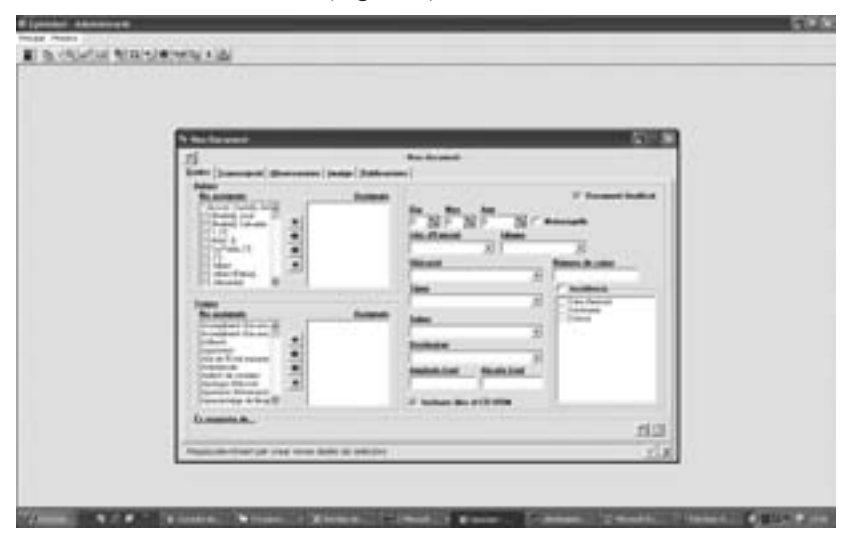
Figure 1. The screen used to enter the letters into the database.

when it had already been published. The transcription of the document was then included in the database (Figure 2).