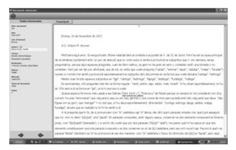
Figure 11. The results of a linguistic search in one of the letters in the corpus.

An example of the possibilities of searching for dialectal forms is found in the appearance of verb forms including a velar extension. Thus, the search for verb endings in "iga" refers us to the documents written by the priest from Ibiza Vicent Serra i Orvai or by the linguist Josep Calveras, whose letters include examples of this sort of ending: the subjunctives càntiga (Standard Catalan: canti 'I sing'), estímiga (St. Cat.: estimi 'I love'), tàpiga (St. Cat.: tapi 'I cover'), adòbiga (St. Cat.: adobi 'I mend'), furàdiga (St. Cat.: foradi 'I pierce'), màtiga (St. Cat.: mati 'I kill') [Figure 11].