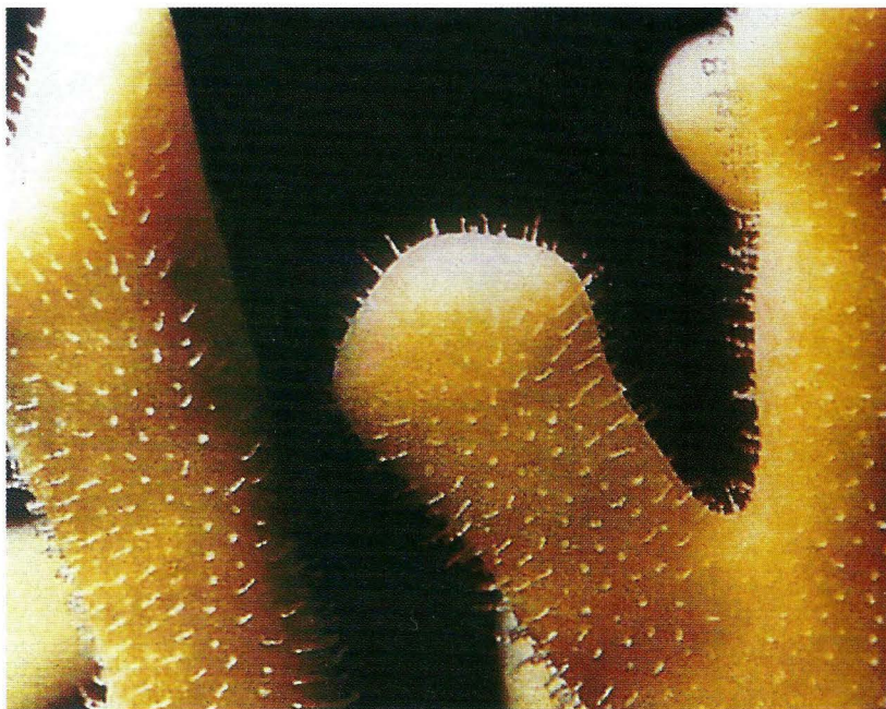
Figure 1. Fire coral, a coelenterate of the milleporina order. It has a protective calcareous skeleton with powerful stinging cells or nematocysts that release toxins. x 2.

It has been observed that while the cutaneous lesions which appear soon after the contact with the "fire coral" depend on the venom toxicity, the delayed or recurrent lesions could be caused by a delayed hypersensitivity response to an antigenic compound of the