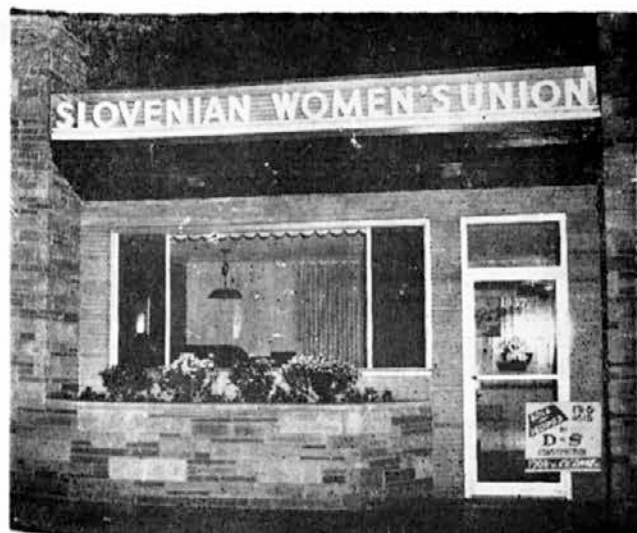
HOME OFFICE OF SLOVENIAN WOMEN'S UNION located in the heart of the Slovenian Community. Members and guests will assemble there Sunday morning for Open House.