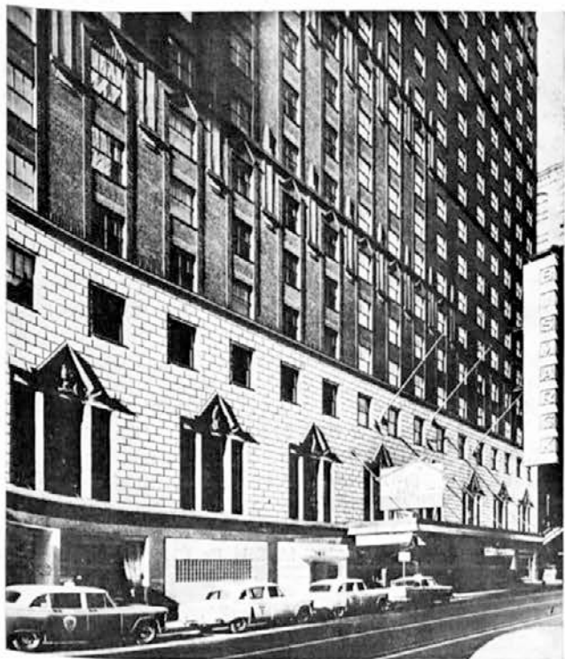
BISMARCK HOTEL IN CHICAGO'S LOOP the Convention Headquarters for meetings and the Grand Banquet and Debutante Cotillion Ball.