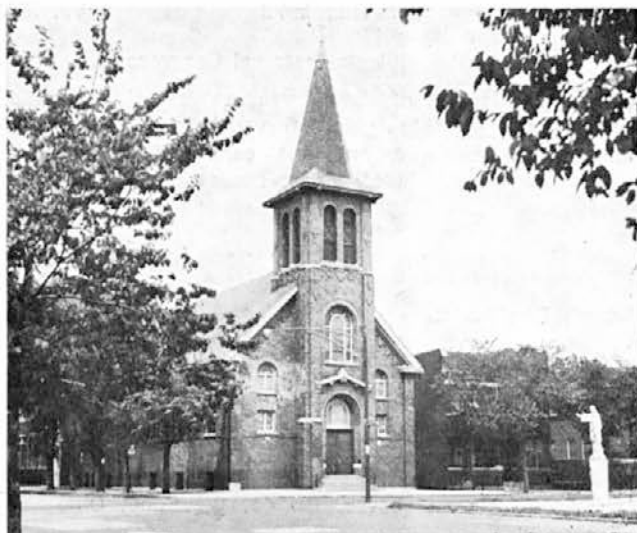
ST. STEPHEN SLOVENIAN CATHOLIC CHURCH celebrating their 75th anniversary this year is the site of appropriate religious ceremonies Sunday morning, May 20th.