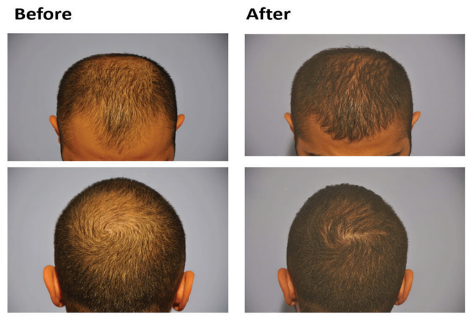
Figure 2 | A subject, 32 years old, with moderate improvement in hair growth as rated by an expert panel at week 24 (before, after).

area hair count increased significantly compared to the baseline (20.9% vs. 4.7%) (5).