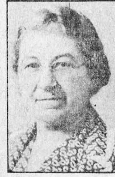
FRANCES LOPP Lodge No. 133, Gilbert, Minn.