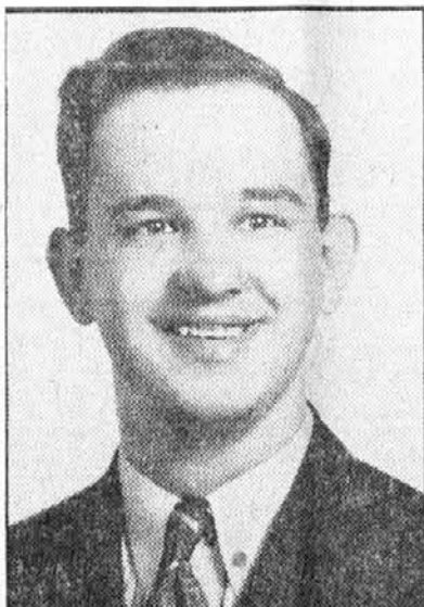
FRANK ZNIDAR Lodge No. 71, Cleveland, Ohio