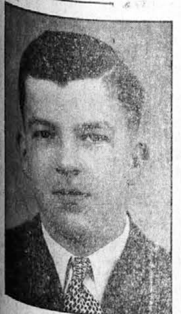
GILBERT ZBASNIK Lodge No. 1, Ely, Minnesota