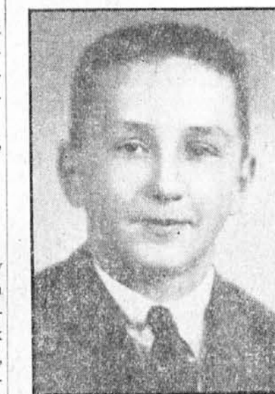
ROBERT J. CHAMPA Lodge No. 184, Ely, Minnesota