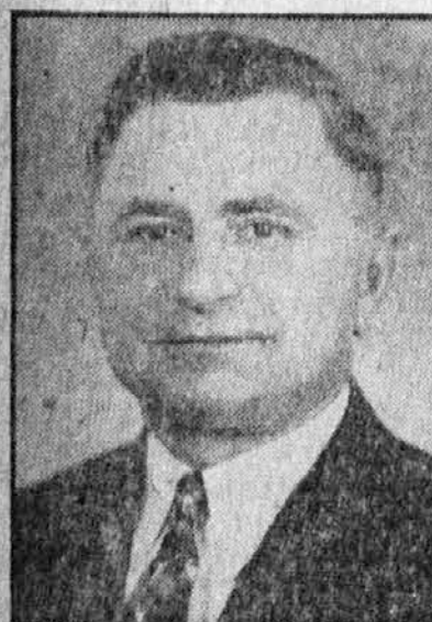
JOSEPH L. CHAMPA Lodge No. 2, Ely, Minnesota