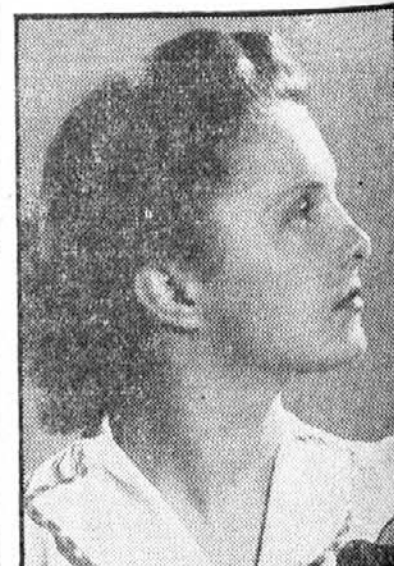
DOROTHY ROSSA Lodge No. 186, Cleveland, Ohio