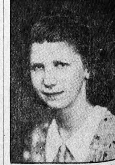
ROSE MERTEL Lodge No. 200, Ely, Minnesota