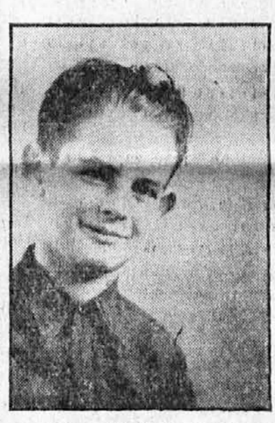
FRANK BRADACH Lodge No. 85, Aurora, Minnesota