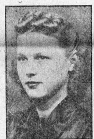
FRANCES FISTER Lodge No. 25, Eveleth, Minnesota