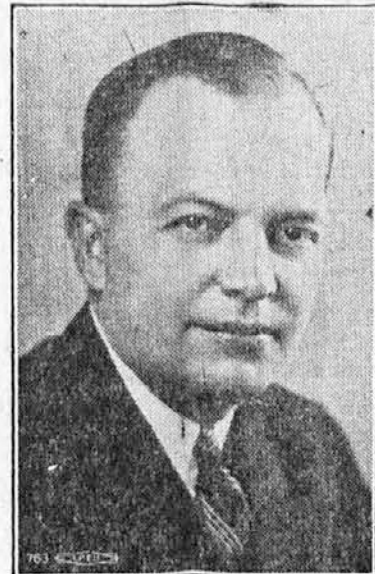
Hon. Harold E. Stassen, Governor of Minnesota

Aboard Chicago and Northwestern Ltd., Enroute to Ely, Minn. — This special car is crowded with happy delegates who are really set to cut it loose as this fast stepping engine is snorting its way toward Northern Minnesota and Ely, where the Fourth Juvenile convention begins as soon as we arrive. The Pennsylvania delegation arrived on schedule and joined the Cleveland group to Chicago. In the Windy City, the other group got on, and