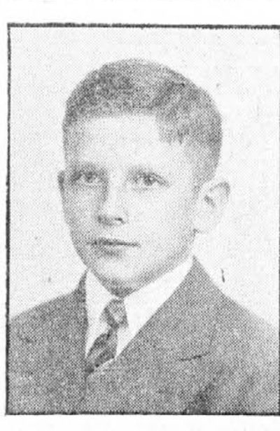
WILLIAM FRANTAR Lodge No. 25, Eveleth, Minnesota