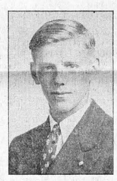
LOUIS KLANDER Lodge No. 25, Eveleth, Minnesota