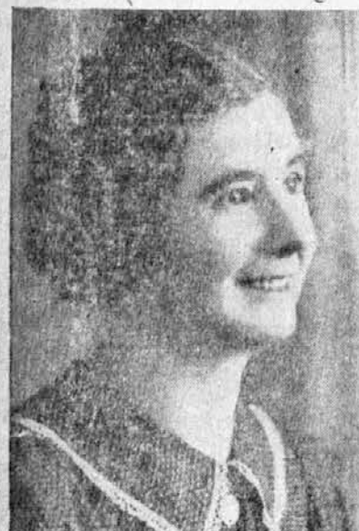
MARY STARTZ Lodge No. 1, Ely, Minnesota