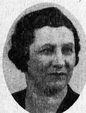
ROSE SVETICH Lodge No. 120, Ely, Minnesota