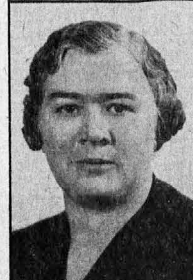
AGATHA GLAVAN Lodge No. 114, Ely, Minnesota