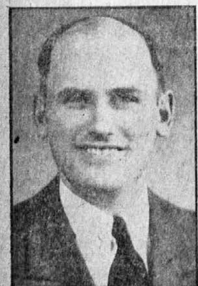
JOSEPH KOVACH Lodge No. 1, Ely, Minnesota