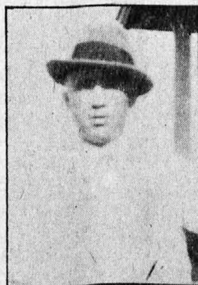
ANTON MURGEL Lodge No. 200, Ely, Minnesota