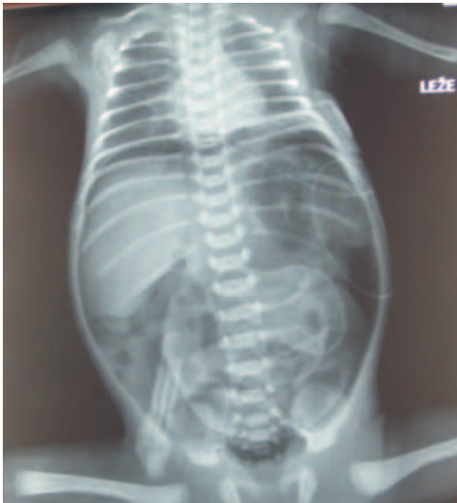
Figure 1. A plain abdominal X-ray showing free air in the peritoneal cavity.

On the 15 th postoperative day, the baby became lethargic and was refusing feedings. An abdominal disten-