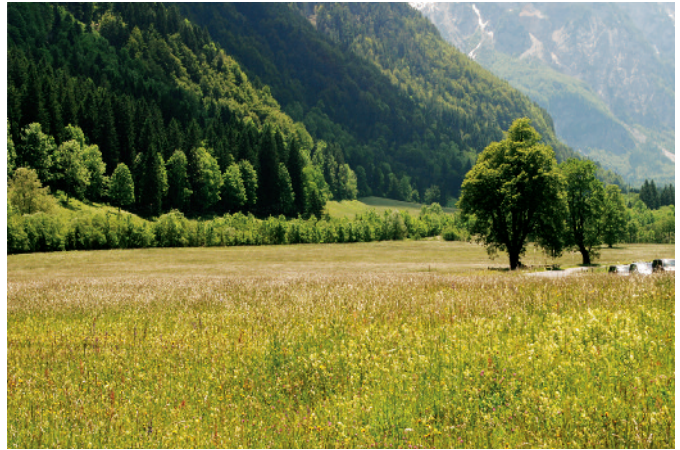
Fig. 2. The Logarjeve njive meadow (Locality D) (Foto: Neža Orel, July, 2014)