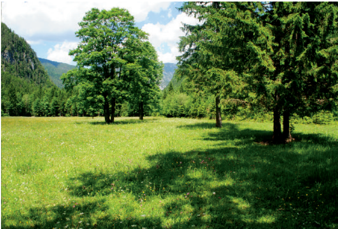
Fig. 3. The pasture at Polanc (Locality E) (Foto: Neža Orel, June, 2014)