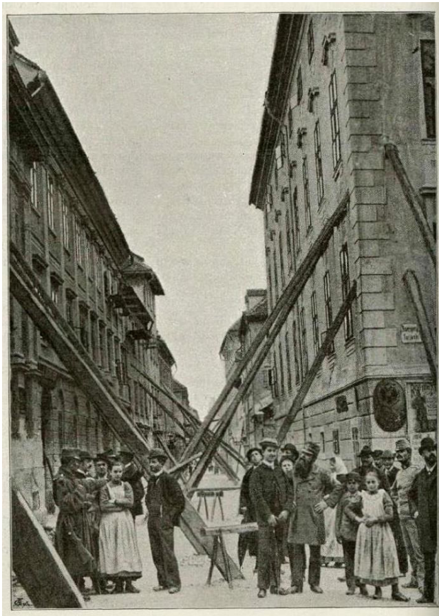
Gosposka ulica (objavljeno v: Dom in svet, 1895, sht. /no. 14)