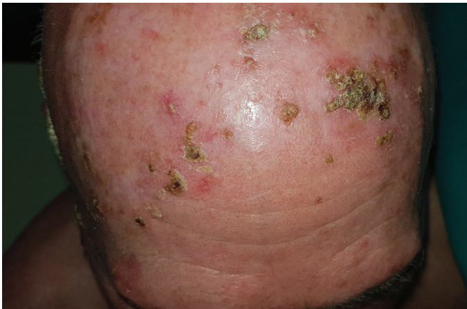
Figure 3 | Moderate inflammation with erythema and crusting on the scalp.