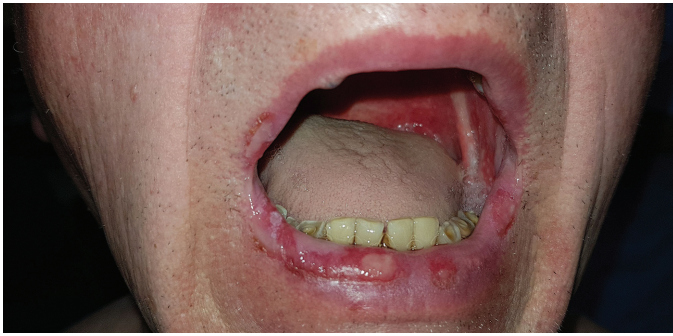
Figure 2 | Mucosal erosions.