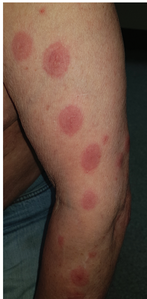
Figure 1 | Targetoid lesions distributed symmetrically on the upper extremities.

a diagnosis of erythema multiforme was made. Because other common causes for erythema multiforme were ruled out, we concluded that imiquimod was the most likely cause. Therapy with imiquimod was stopped. The patient was treated with topical corticosteroid cream, and after 20 days of therapy all erythema multiforme lesions disappeared. Residual actinic keratoses were treated with cryotherapy.