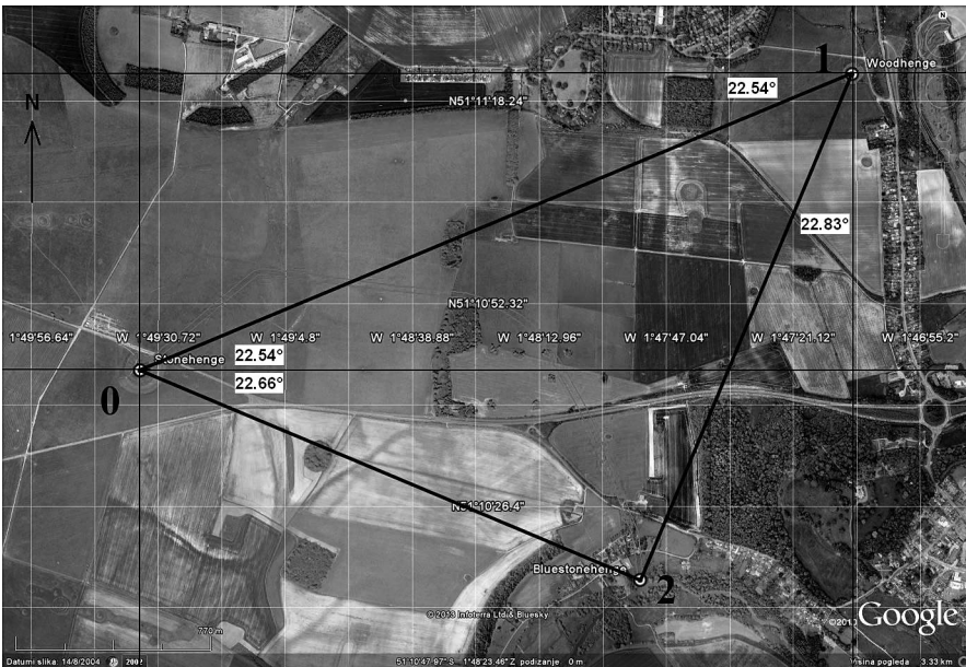
Figure 2: Stonehenge triangle superposed on the Google Earth Satellite Map (0: Stonehenge; 1: Woodhenge; 2: Bluestonehenge; Grey lines: ditches of the Avenue and of the henges) Visualization of the ditches is done with the help of Google Earth layers prepared by the Archaeology Group at Bournemouth University http://download.bournemouth.ac.uk/apsci/srp/Seeing-Beneath-Stonehenge.kmz