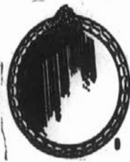
PLATE GLASS MIRRORS Made to Order and Re-Silvered Furniture Tops, Plateaus, Monograms, etc. Rock Crystal Cut Glass Goblets, Sherbets, Salad Plates Cut Glass, etc. Mfgd., Repaired and Matched

215 HURON ROAD CHerry 8090 Near Ontario Factory Prices