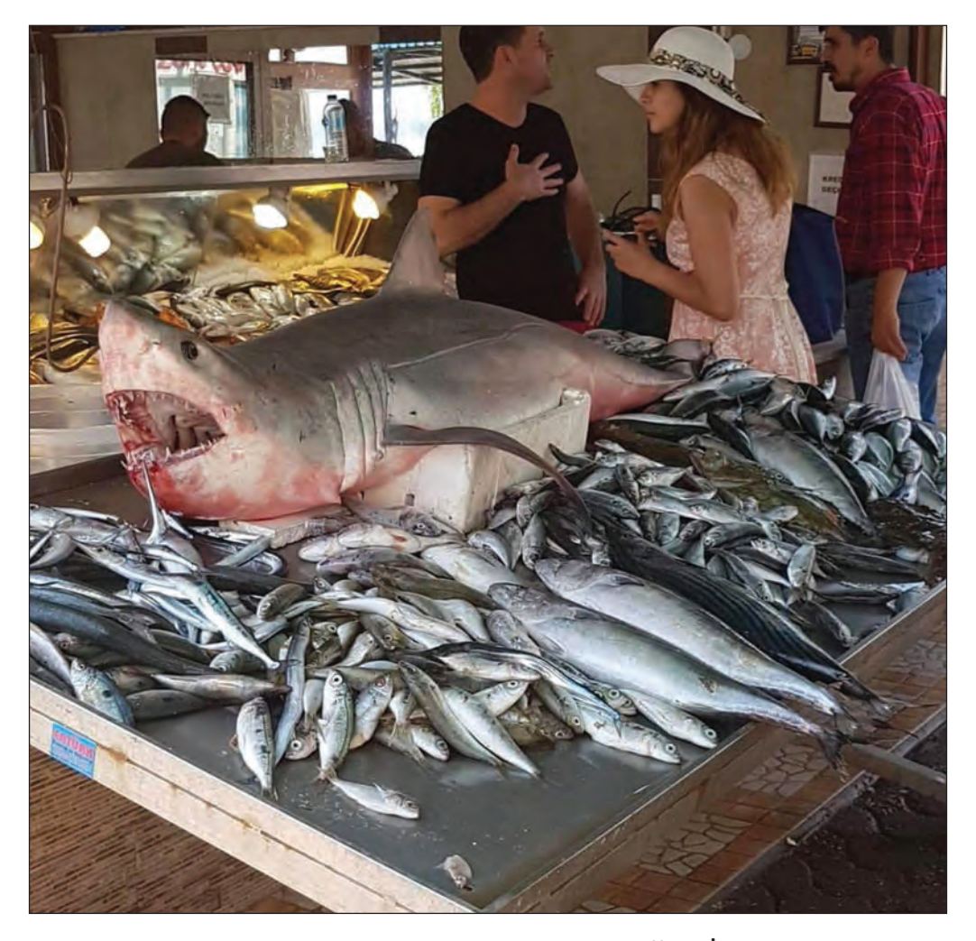
Fig. 4: Carcharodon carcharias, captured on April 14, 2018, off the İzmir coast.