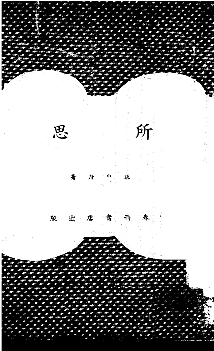
Figure 1: The title page of the 1931 publication of the book Suosi 所思 (Reflections)

dialectical-analytical method. Secondly, what Zhang further proposed was a syncretic marriage between the above-described dialectical principle on one side and scientific objectivity on the other. 31