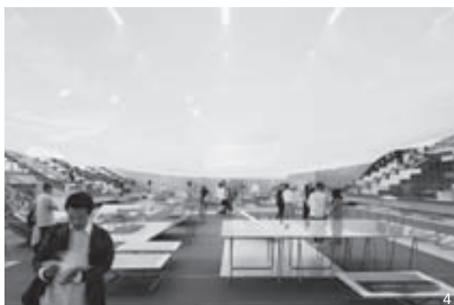
Sl. 1-4: Baltski paviljon na Beneškem bienalu 2016.

http://balticpavilion.eu/ (foto 1 in 2: Anis Starks; foto 3 in 4: David Grandorge).