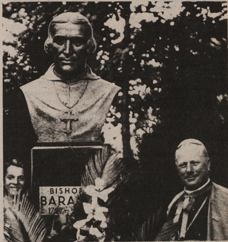
Archbishop Rožman at the unveiling of Bishop Baraga bust which took place on Sept. 22, 1935. It was dedicated by Archbishop Dr. Gregory Rožman of Ljubljana, Slovenia.