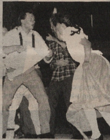
Village boys are caught going through Reza's laundry. Reza was played by Rezka Kolarič. The play was about wash day in the Village of Suha. Reza, the mayor's daughter consistently rejects all suitors who do not meet her standards.